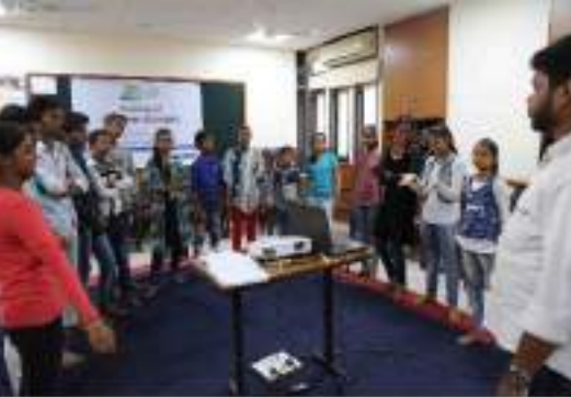
Child Health and Sports Cooperative (CHSC)