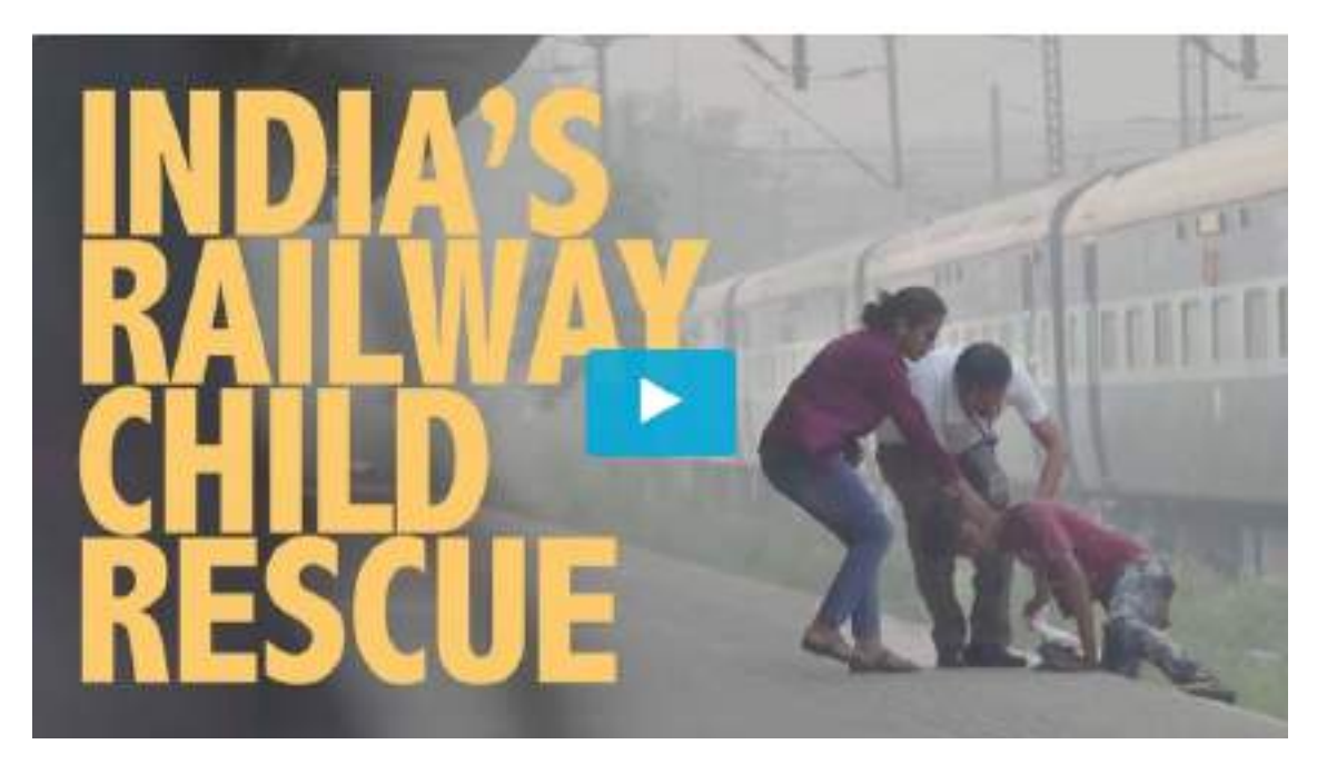
Support India's Railway Child Rescue Campaign

A one-day training for 14 Buddies (child mental health counselors) was organized on the concepts of 'Child Mental Health', 'Basics of communication' and the 'Process of peer support'.